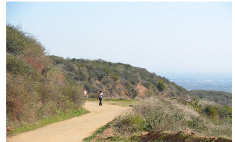
Claremont Hills Wilderness Park 5-mile loop

The park opened in 2010 and is used by numerous soccer associations. The park is 24 acres with 17 acres of developed park area. It includes a soccer field, fitness course, walking trail, and restrooms.